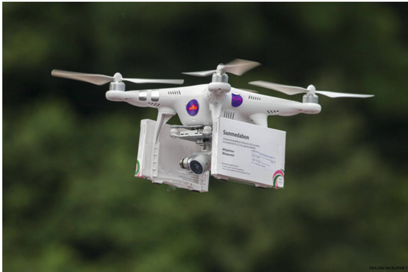
BORDERS: The drone crossed the Irish border with the pills

In a statement they said: "The 'abortion drone' will mark the different reality for Irish women to access safe abortion services compared to women in other European countries where abortion is legal."