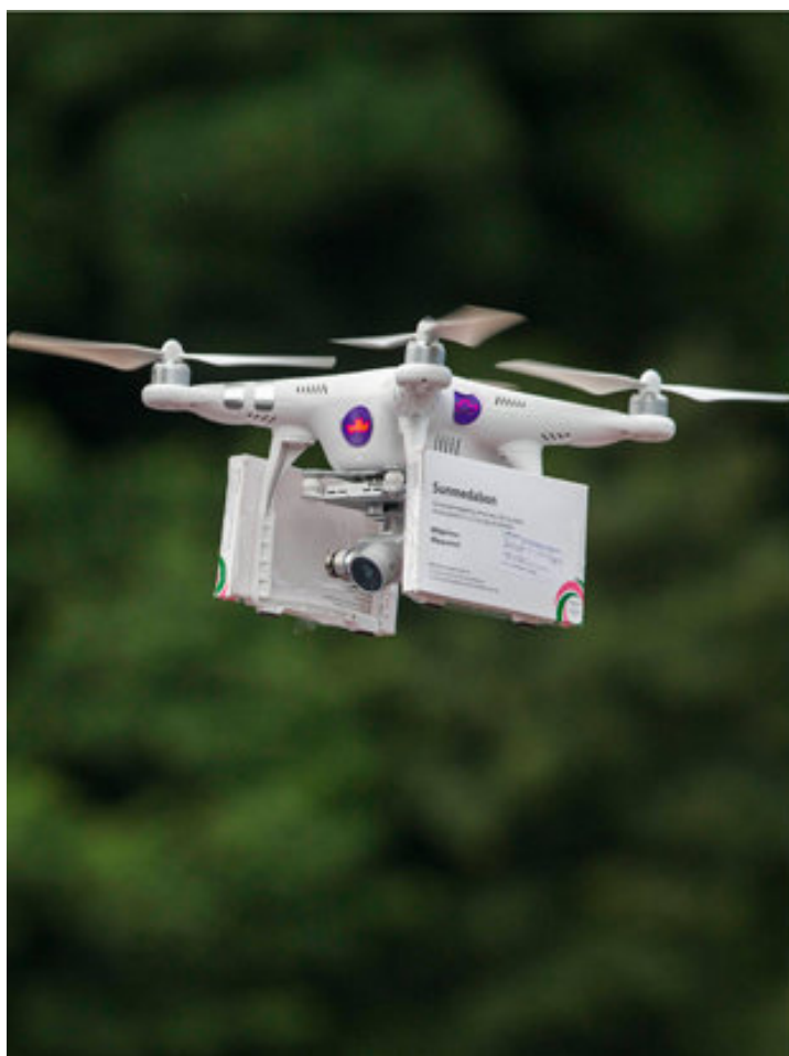
FLYING: It has been named the 'Abortion Drone'